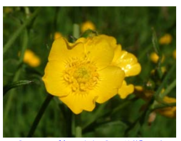
Buttercup 25th May 2010 - Beaks Hill Triangle