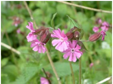
Red Campion 25" May 2010 - Wychall Cycle Rowte

Correspondence by email preferred: KingsnortonInr@aol.com Registered Charity No. 1122293 www.fknnr.org.uk