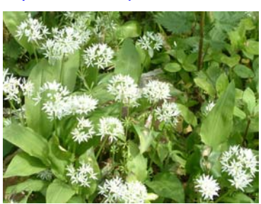
Ramsons 17th May 2010 - Wychall Reservois