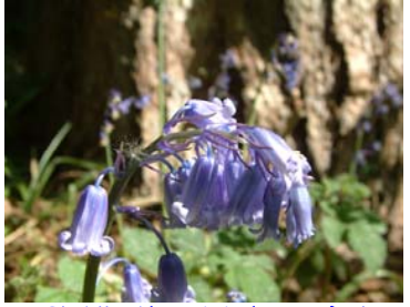
Bluebell 25th May 2010 - Merecraft Pool