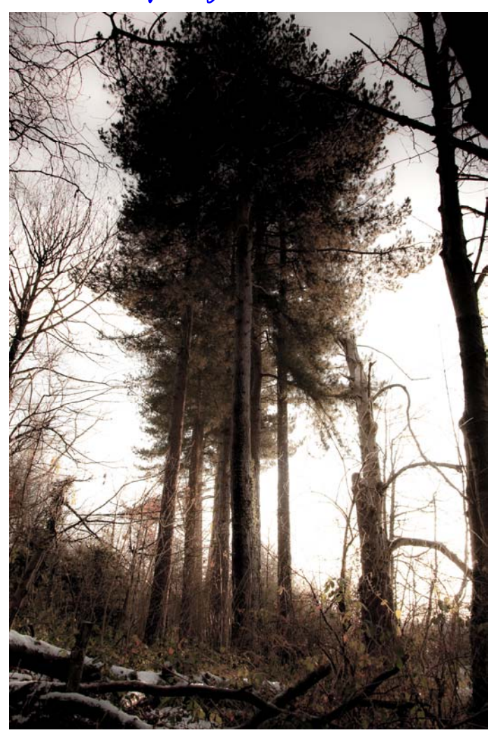
Another reminder of last winter: The Pine Trees on the edge of Merecroft Pool on Christmas Day 2009. The trees received a present of several bird boxes at the end of June.