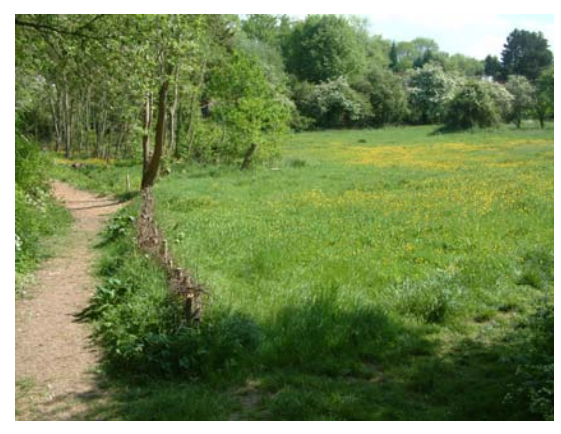
The result of working party activity – A redefined path with wood chip surface and a hazel 4 Hornbeam fence line. The meadow in the Beaks Hill Triangle in May with a show of Buttercups

Correspondence by email preferred: KingsnortonInr@aol.com Newsletter 23 Registered Charity No. 1122293 www.fknnr.org.uk