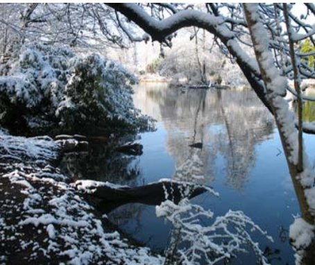
Another pleasant day and Merecroft Pool reflections catch the eye.