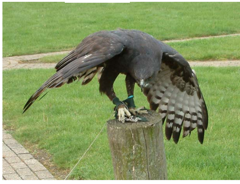
Will the Hawks return to the FKNNR Open Day? Now planned for the 11<sup>th</sup> September 2010.

The Newsletter of the FKNNR - £2 to non-members.