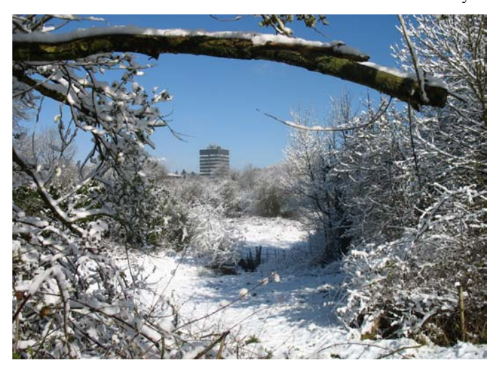
The corner of the British Waterways Meadow and a view towards the 'TrinleX Tower"

Correspondence by email preferred: KingsnortonInr@aol.com Registered Charity No. 1122293 Newsletter 22 www.fknnr.org.uk