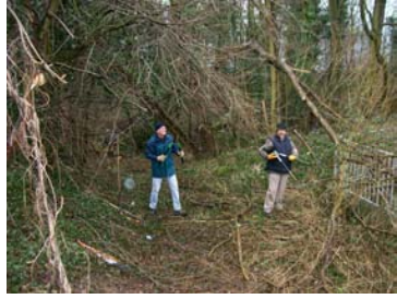
Working party activity at Merecroft in 2009 and in Burman's Drive in 2007.