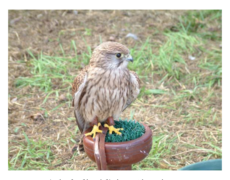
Another of our falconer's friends poses at the open day. A Common Kestrel Falco tinnunculus appreciates a sunny event.