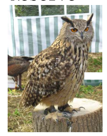
One Eagle Owl on display at our open day. But...

The end of October resulted in several exotic events. Working party activity on the 30<sup>th</sup> was interrupted by the calls of a small parrot perched in a tall crack willow tree by the River Rea whilst on the previous day over 50 Corvids, mainly Crows and Magpies, were intent on mobbing a serious predator. This turned out to be an Eagle Owl, which we believe was previously kept at a location not far from Grassmoor Road! A good sighting of the Owl perched in a sycamore tree helped explain previous Corvid discontent in the area. Has anyone any further information on local aviaries?