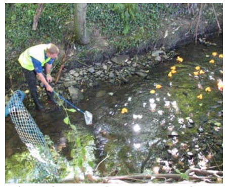
The Duck Race on the River Rea reaches its climax at the recent Open Day