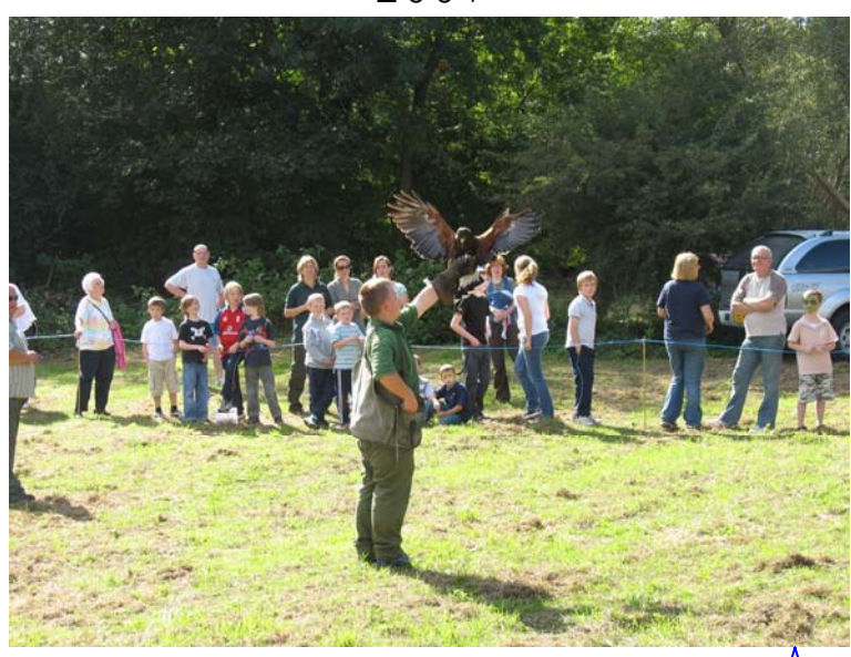
The highlight of the September open day was the falconry display. A Harris Hawk was a star performer on Kings Norton Local Nature Reserve— the hawk was demonstrated by 'Heart of England Raptors'.