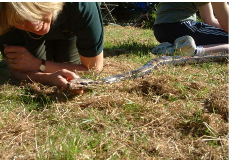
Boris the Boa Constrictor liked having his chin tickled

We were extraordinarily lucky in the weather for our Open Day, held the Meadows alongside the River Rea beside Wychall Lane. A clear cold start for the set-up, with mist rising from the grass, was followed by brilliant sunshine all day, allowing visitors to spend generous time looking at the exhibits and chatting with friends and neighbours.