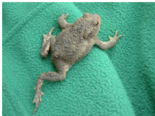
One Toad disturbed near Sheila's ponds

Thank you for your continued support of the Friends' efforts to improve our patch for wildlife and for the local community.