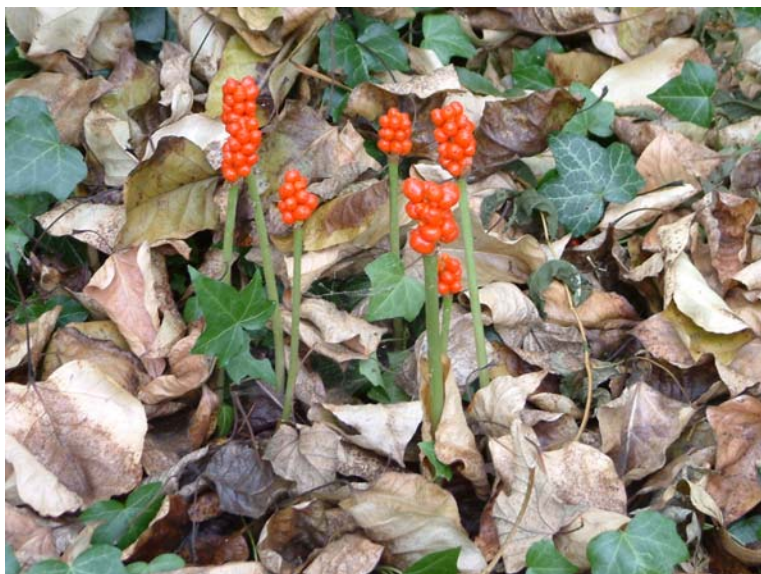
A plant species given specific protection in England – Arum maculatum also known as 'Cuckoo-pint' or 'Lords & Ladies'. It grows freely in many parts of Kings Norton Local Nature Reserve