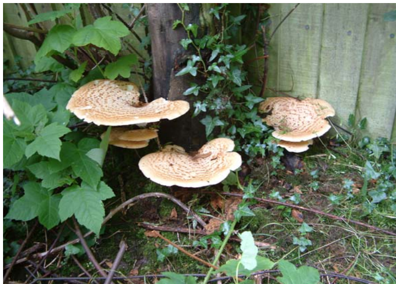
A magnificent show of Dryads saddle Polyporus squamosus on an old tree stump in the BW meadow at the end of June 2007.