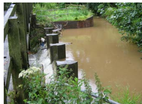
The Reservoir inflow point on the morning after. A relatively clean area since all the usual rubbish had been washed into the Reservoir.