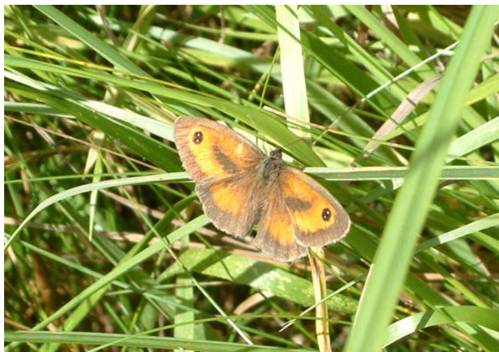
A gatekeeper butterfly poses in the BW Meadow on the 31 July 2007 (a sunny day!).

Environmental Agency Hotline 0800 807060 West Midlands Police 0845 113 5000 ext. 7826 6363 Community Police 07769 882113 Anti-social behaviour Hotline 0121 303 1111 Street Champions 0800 0730528