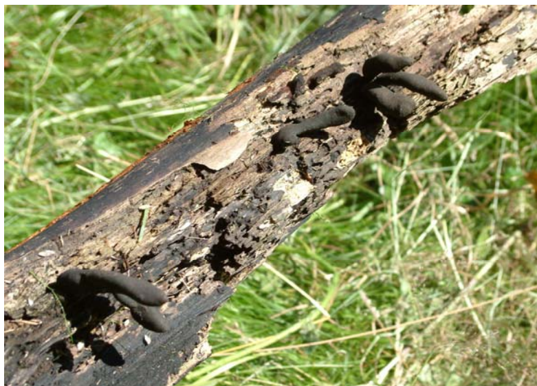
In the same meadow at the end of July, working party activity uncovered another