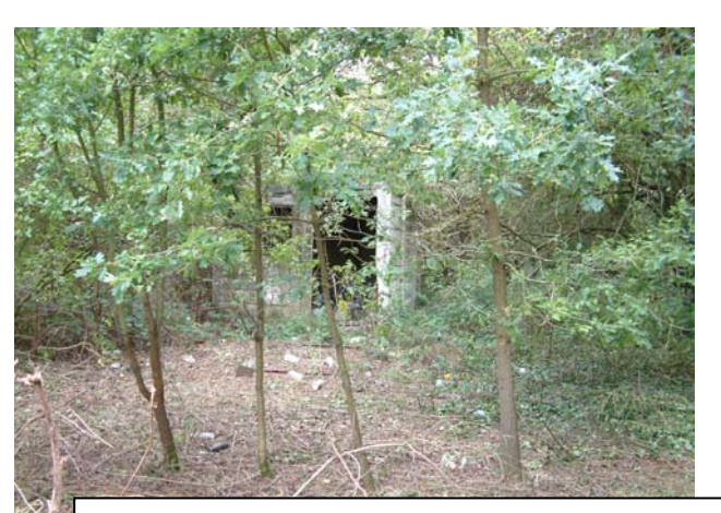
The jungle that was Pinehurst is cleared away very slowly to reveal a potential bird observation hide (above) in amongst young Oak trees and the possible route for an educational walkway (below).

To the south, the meadow grassland between Beaks Hill Rd and Meadow Hill Rd will come under a revised mowing regime and the Crack Willow trees will, over time, be coppiced or replaced with more resilient wet area species. The former Orchard site adjacent to Beaks Hill Rd is currently receiving a makeover with the removal of non-native Laurel and Sycamore and the strengthening of the boundary line with a dead hedge and additional planting. These measures should not only improve the appearance of the area but also allow for the access of mechanical means to cut the grass – perhaps in the longer-term we can then bring in livestock to manage this grassland in an eco-friendly manner. Views on this would be welcomed.