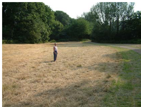
July 2005 - Amanda Cadman surveys the mown area.

We mention elsewhere the construction of floating islands. One short working party day involved two men in a small boat trying to do something similar on Merecroft Pool. They established that if they both stood on the same side of the boat at the same time then they get an early bath but a short working day. No guesses to establish whom these two wet individuals were but the garden of one of them backs on to the pool and the other usually stands on the bank and counts the birds. They are already quite old but