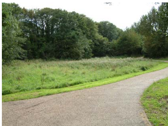
August 2004 - View West