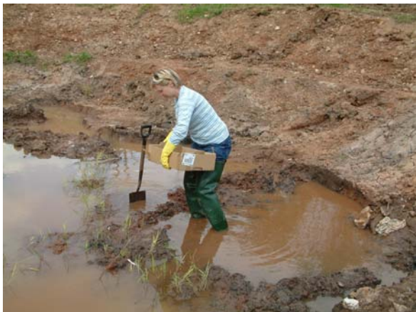
Its now May (above): The water depth is adjusted and the planting process commences.