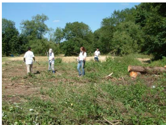
July 2005 - The same area now minus the tree. Some young volunteers enjoy the sun.