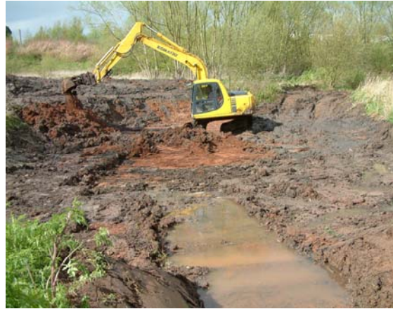
April: The excavator gets to work.