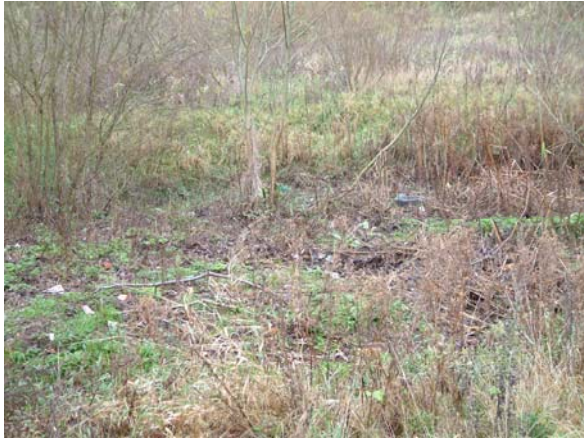
Above: The area to be cleared of silt and rubbish as it was in November 2004

As reported in the last newsletter a bid was submitted to the Heritage Lottery 'Awards for All' scheme for funding which would allow us to restore a small area of the reedbed at the reservoir site as a practical demonstration of something that would improve the wetland habitat considerably. This bid was successful and we duly received £3,420. The initial work has been started on site and we secured the services of a large excavator on the 27 April. Two large but shallow areas of the former reedbeds have been cleared and some 600 Norfolk Reeds were planted by a 'Friends' working party on the 18 May. This has been the focus of recent activity at this end of the LNR. Further planting is required in the first lagoon and then we shall proceed into the slightly larger, but deeper area. An interpretive board will be erected on site. Plans to finish the site are now to hand following a couple of abortive exercises when the area fulfilled its primary function as part of Birmingham's flood defence system. The water level certainly rises quickly when the Rea is in spate! (it came over the top of the bank shown in the bottom right photo)