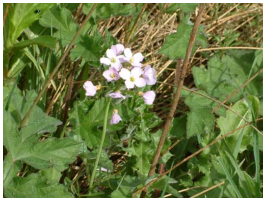
Cuckoo flowers in abundance around Wychall Reservoir on the 29 April.

Please note that these fell due on the 31 May for all those members who joined before November 2004. Please send £5 (£3 Concessionary rate) to the Treasurer at 27 Meadow Hill Road as soon as you are able. Extra donations would be gratefully received. All such sums are being used to protect our local environment through the development of Kings Norton LNR. Your continued support is appreciated very much.