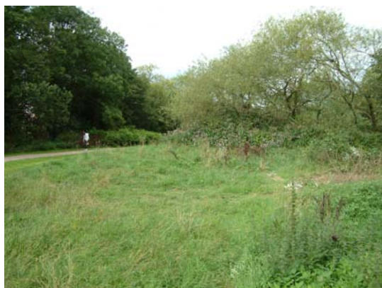
August 2004 - View east from the path junction showing the fallen tree.

We are extremely grateful to BTCV for the training sessions and grant to cover these activities with £3,740 being made available from the 'People's Places Award Scheme'.