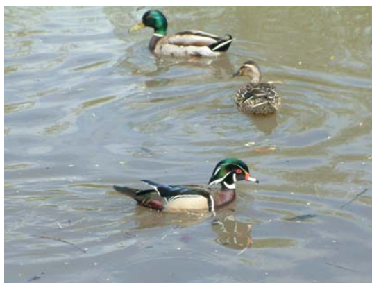
And a final view of the Wood Duck in the company of the local Mallard.

Please keep the following number to hand – 0800 807060. It is the Environment Agency Hotline for pollution/damage or danger to the natural environment. We had to make use of it on the last weekend in June when heavy rain and flooding appears to have washed an unknown substance into the old millstream and into the Rea. We shall monitor this pollution incident – Number 521156, if anyone wishes to enquire about it on the 0800 number. AND Don't forget that anti-social behaviour can be reported on 0121 303 1111.