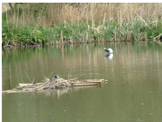
The resident Coots utilising our home made floating islands also on the 29 April.